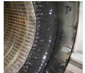
Main stator windings coated with black compound.