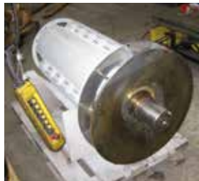
Main rotor EG43 coated pre assembly.