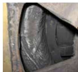
Fig 2. Carbon contamination to the windings.