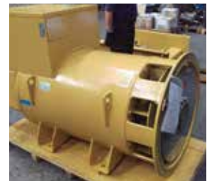
Machine painted and ready for dispatch.