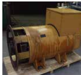
Machine post test.