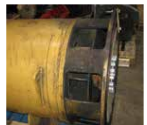
Fig 3. Machine viewed from rear during the inspection process.