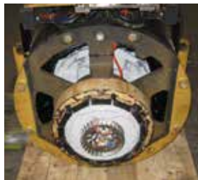
Machine viewed from rear post assembly.