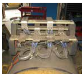
Fig 1. Terminal box assembly dirt build-up.

The varistor mounted on the Diode Assembly was also found to be defective.